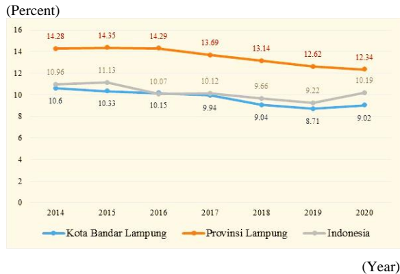
Figure 1. Poverty data for the City of Bandar Lampung, Lampung Province, and Indonesia for 2014-2020

Another cause of poverty is the lack of human resources. If the poor do not have skills, they will not have income which causes less purchasing power so they are trapped in the cycle of poverty. The success of a region depends on the Human Development Index (HDI). HDI is a simple measuring tool to determine the success rate of human resource development. According to BPS (2021), the HDI of Bandar Lampung City which has been achieved in 2020 is 77.44 points. This shows an increase of 0.11 points from 2019 which reached 77.33 points. This condition indicates that the welfare level of the population of Bandar Lampung City is increasing. This condition is unfortunately not matched by a decrease in the number of social problems. BPS noted that in 2017 the number of social problems in Bandar Lampung City was relatively high. In some cases of social problems, the highest number in Bandar Lampung City is the number of the poor as many as 100.5 thousand people.