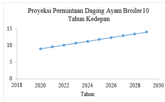
Figure 2. Projection of Broiler Chicken Meat Demand in Bali Province in the Next 10 Years

Figure 1 and Figure 2 shows the supply and demand for broiler chicken will simultaneously increase. So the price of broiler chicken in the next 10 years will be stable, with different prices and levels of stability each year. It will happen when breeders and buyers want to make the maximum profit. When prices are high, breeders will increase the supply of broiler chicken and consumers will continue to buy broiler chicken because it is driven by nutritional fulfillment factors and increased income per capita each year.