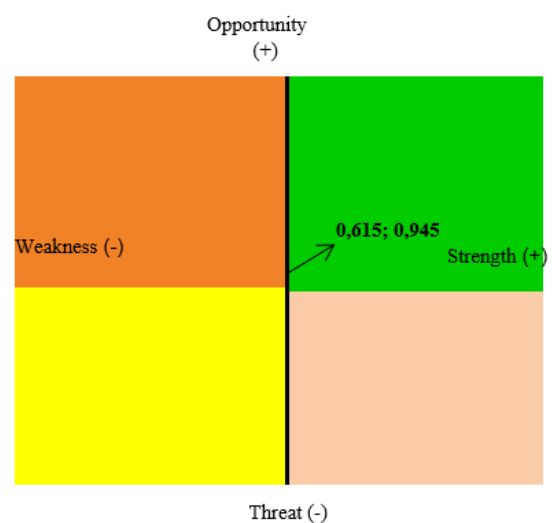
Figure 2. SWOT Matrix

Based on the result of weighted score between internal and external factors are 0.61;0.95 respectively. These coordinates are illustrated in SWOT matrix in Figure 2.